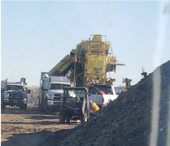
1. Ditcher Maintenance - 39+980km - Oct 23, 2017