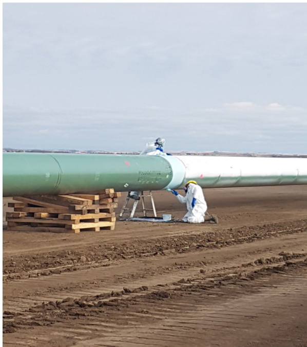
4. Coating - 70km+700 - Oct 26, 2017