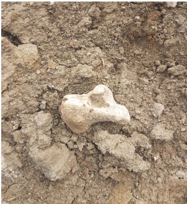
3. Bone - Km116+ 500 - Oct 24, 2017