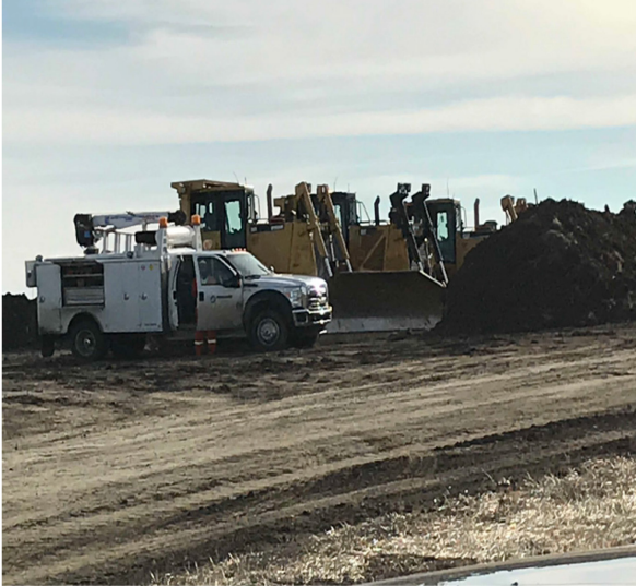
9. Stripping Crew Prep – Km144+200 – Oct 27, 2017