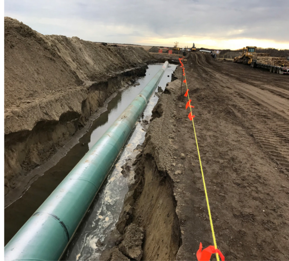
10. Flooded ditch with pipe – Km 44+200 – Oct 28,2017