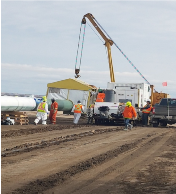
5. Coating Crew – Km70+700 – Oct 26, 2017