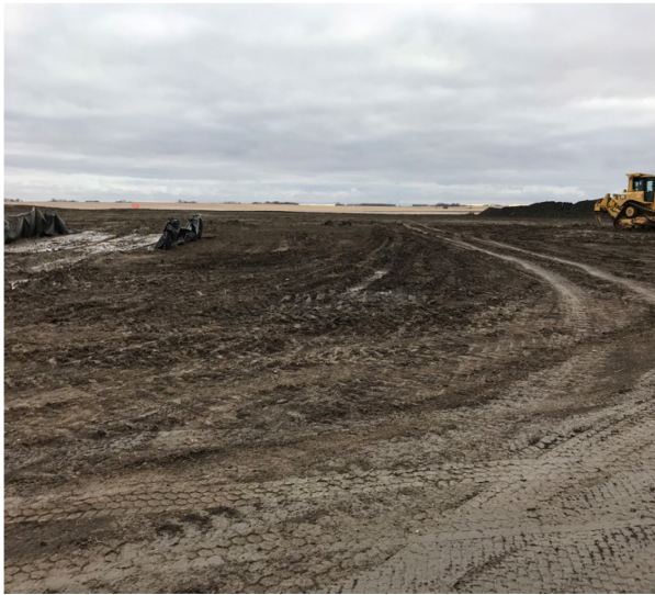
7. End of Spread 1 – Km 144+150 – Oct 26, 2017