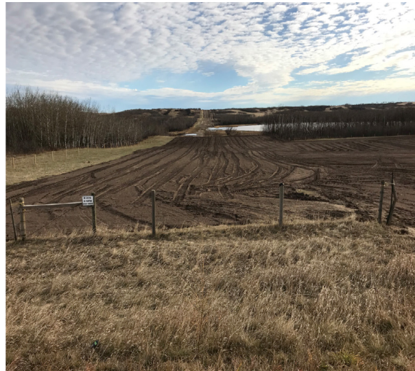
12. ROW East at kickoff – Km 0+800 – Oct 28, 2017