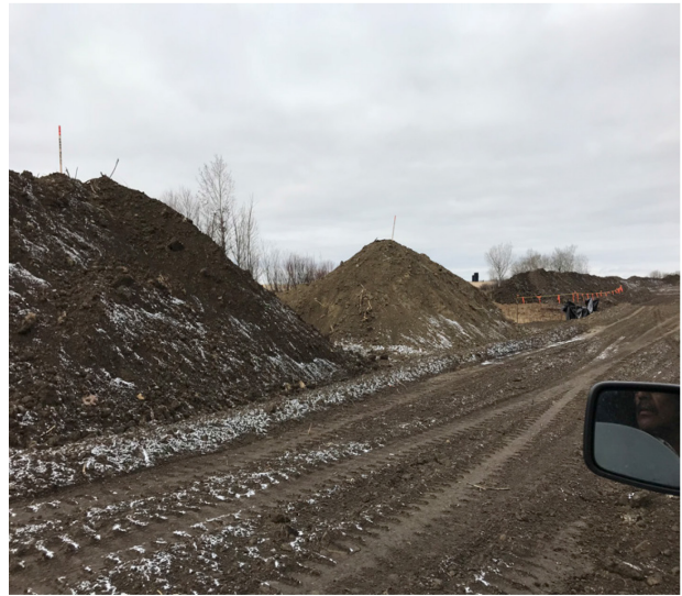
8. Dirt Piles on ROW – Oct 26, 2017