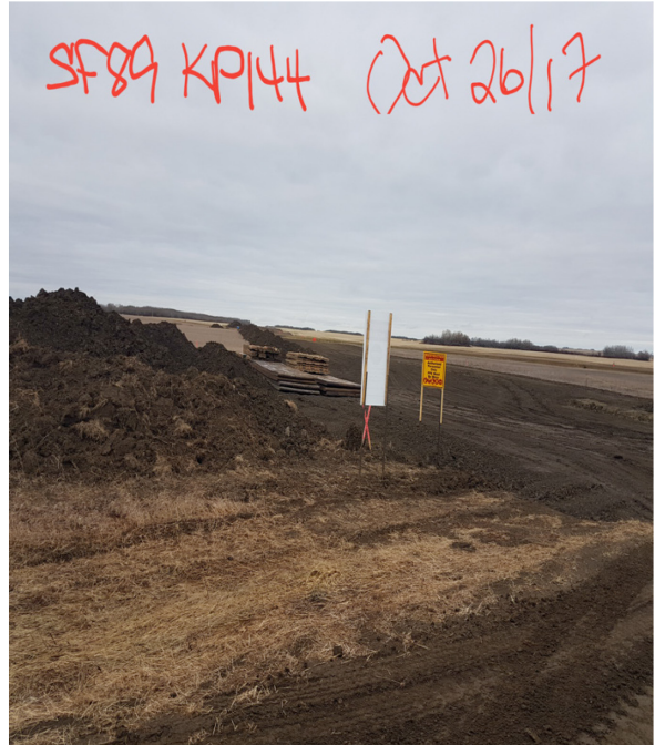
6. Area Stripped at Km 144 shoofly 89 – Oct 26, 2017