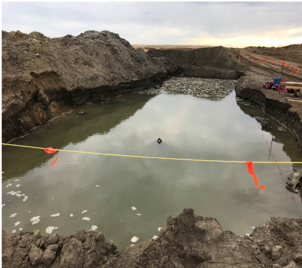
11. Flooded bell hole – km 43+650 – Oct 28, 2017