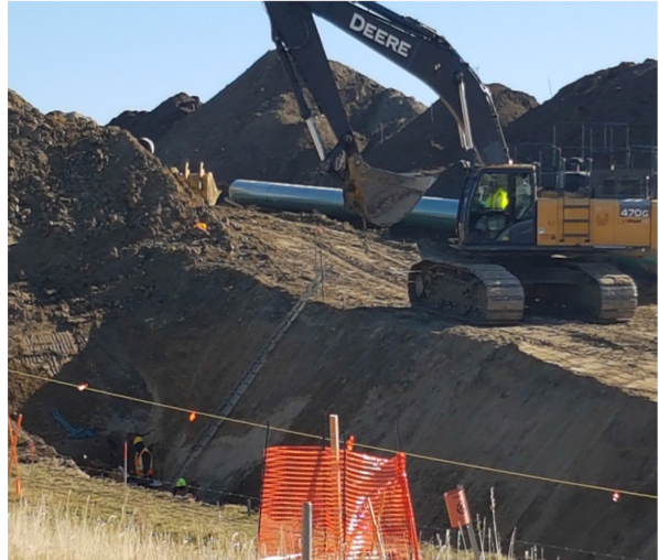
2. Bore tracking activity - 41km+649 - Oct 23, 2017